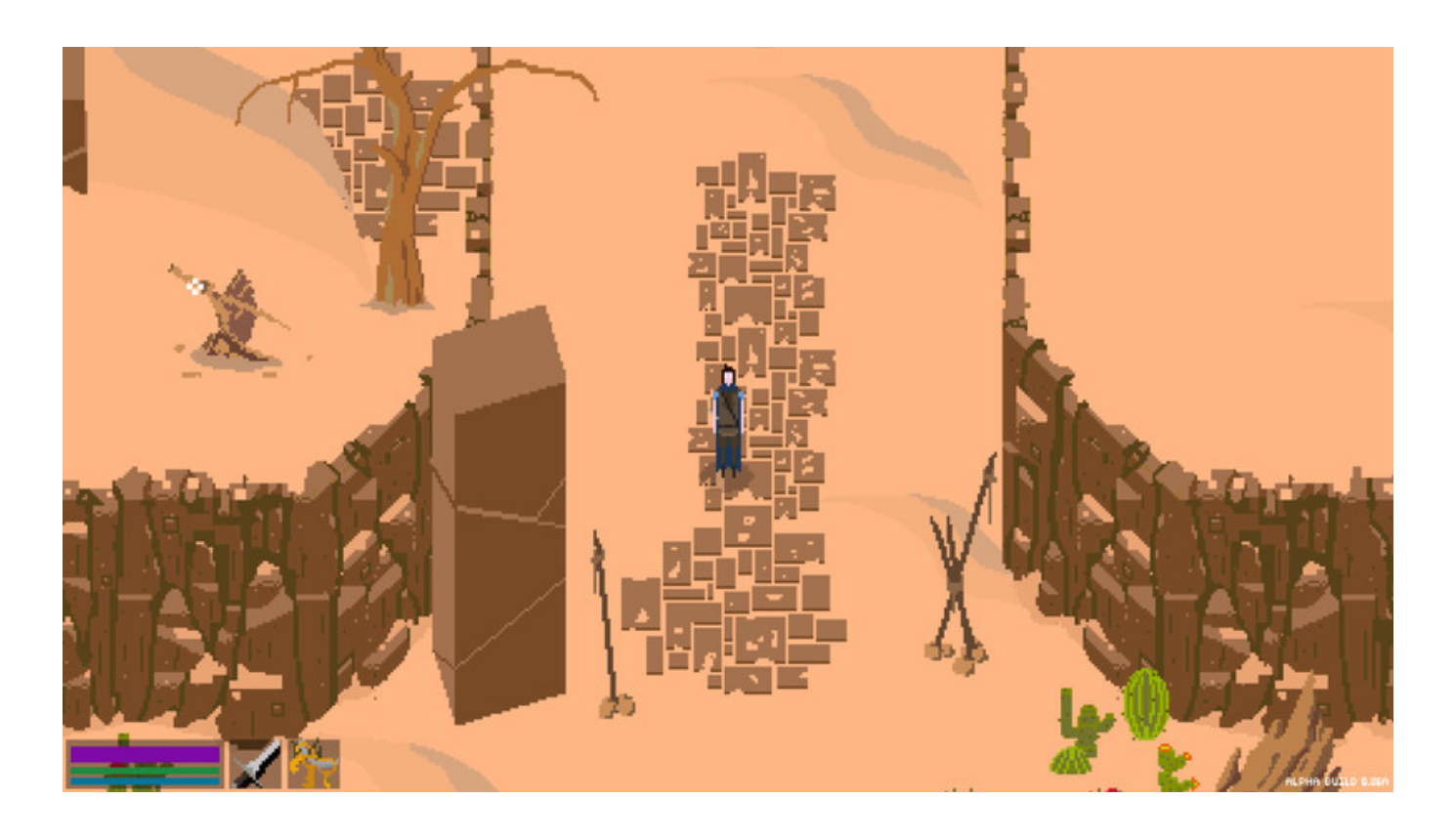
Elden: Path Of The Forgotten Ativador Download [hacked]